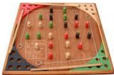
JEU DE PÊCHE