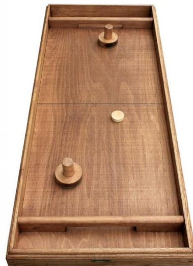
TABLE A GLISSER