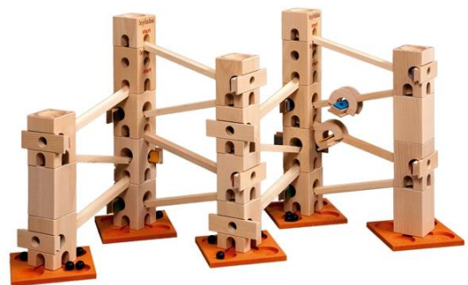
XYLOBA (CONSTRUCTIONS MUSICALES)