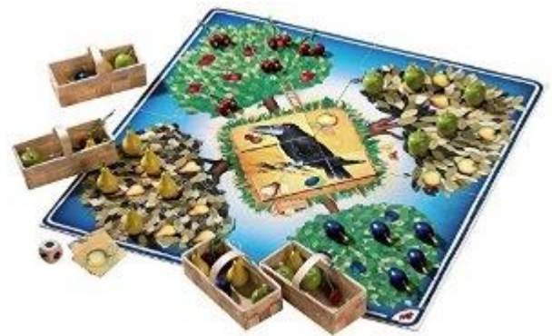
LE VERGER GEANT